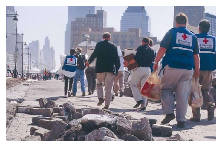
Clinicians sprang into action on 9/11 as volunteers.

Responding to 9/11: Sadly, all the Society's energies were consumed by the terrorist attacks of 9/11, which took place during Allen DuMont's presidency. Our members sprang into action the first night as volunteers with the American Red Cross and other organizations. We were stationed in CONTINUED ON PAGE 22