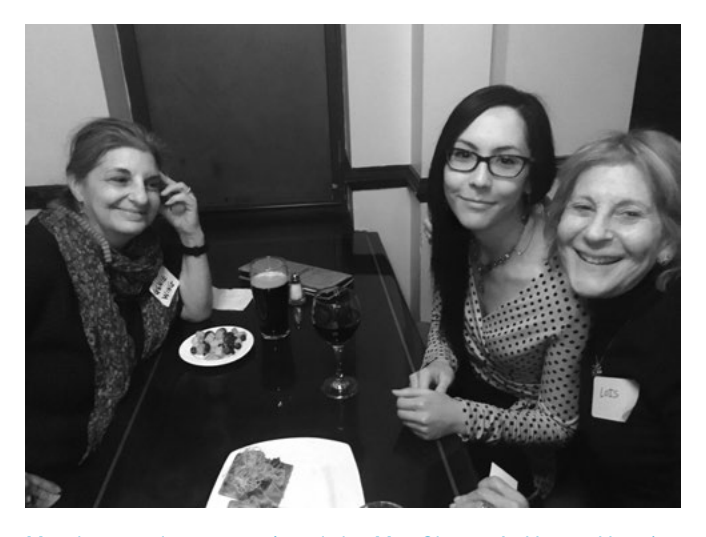
Members and guests enjoyed the Met Chapter's Happy Hour/ Meet and Greet event at Genesis in New York City on March 3.

SATURDAY, OCTOBER 21, 2017 GENERAL MEMBERSHIP MEETING THE NEW YORK BLOOD CENTER 310 EAST 67TH STREET, NY